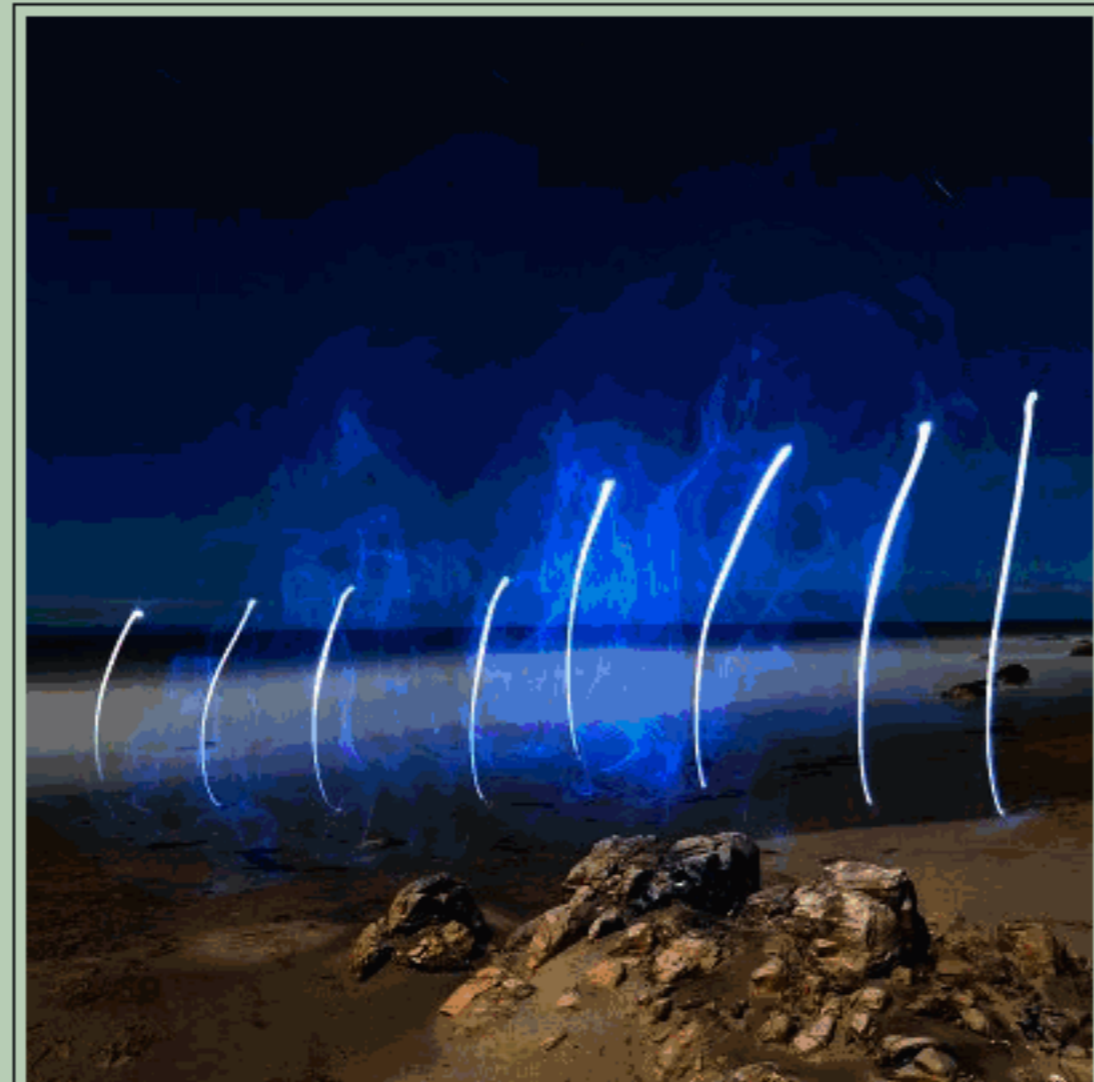
Nebulous In Blue Toby Keller Website: BURNBLUE Photography & Design