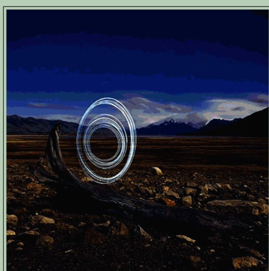
No. 54, Nacional Los Glaciares, Provincia Santa Cruz, Argentina 2007 Cenci Goepel and Jens Warnecke Website: Lightmark

Many other photographers experiment with low light, or painting with light, photography and showcase their images online. Here are four artists whose images I found particularly interesting: